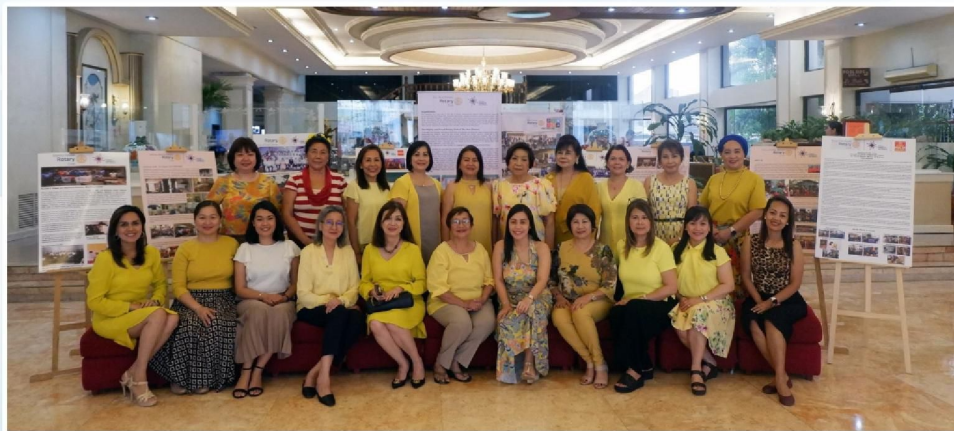
The Downtowners during RCDD's 27th Charter Anniversary